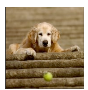
Tugboat demonstrates the art of 'lazy-dog fetch'

Tugboat liked to eat. He never turned down food and often sought it out. He figured out that kids in strollers equaled sticky treats, and pigeons crowded on the ground equaled breadcrumbs. He remembered where the cafés set up their tables during the day, and did his best to help clean up after the patrons at night. The city of Girona could have hired him as a street cleaner.