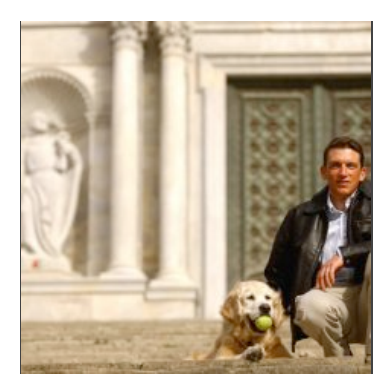
Tugboat and Tyler

By Tyler Hamilton, Phonak Hearing Systems professional cycling te